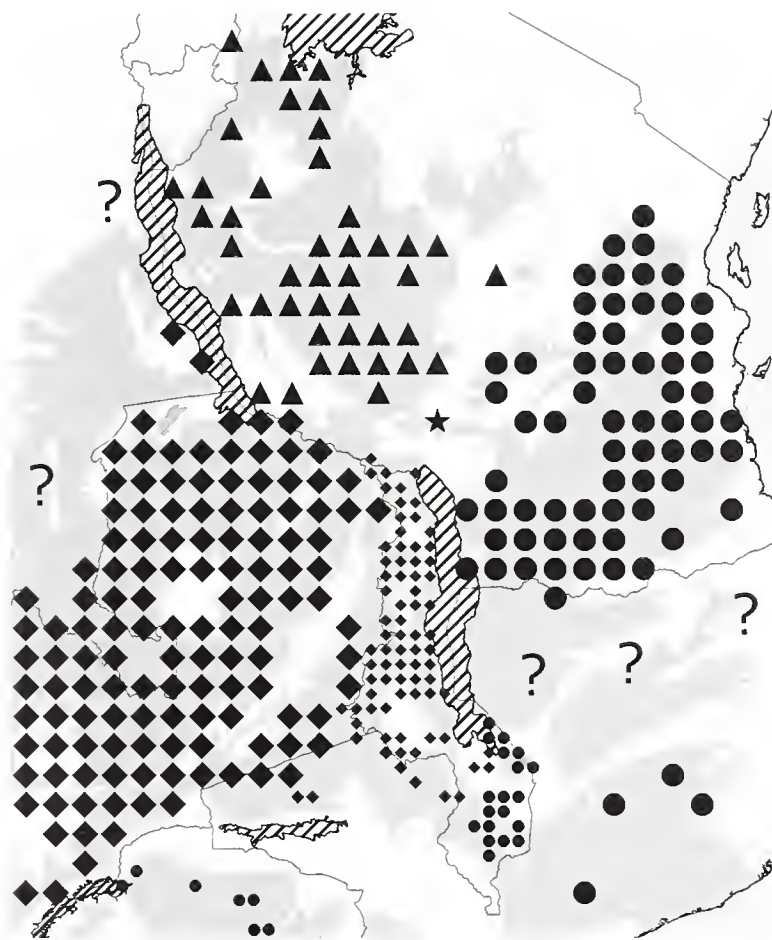
Figure 1. Atlas data for M. r. rufiventris and M. r. pallidiventris in Tanzania and adjacent countries. Diamonds = masukuensis , triangles = western pallidiventris / masukuensis , circles = eastern pallidiventris . Star indicates erroneously labelled White-bellied Tit M. albiventris (FMNH 216938). Question marks indicate data deficient regions. Mid grey indicates distribution of major areas of miombo woodland mapped at broad scales by White (1983).

279710). Given the collecting locality (Mzimba District, Northern Region, Malaŵi) and plumage coloration in photographs, this specimen is also masukuensis not pallidiventris . This means that no specimens of M. r. pallidiventris have been genetically sampled to date. In the absence of such data, given the findings described below, I choose not to treat rufiventris and pallidiventris as separate species.